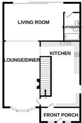
TOTAL FLOOR AREA: 2293 sq.ft. (213.0 sq.m.) approx.

Whilst every attempt has been made to ensure the accuracy of the floorplan contained here, measurements of doors, windows, rooms and any other items are approximate and no responsibility is taken for any error, omission or mis-statement. This plan is for illustrative purposes only and should be used as such by any prospective purchaser. The services, systems and appliances shown have not been tested and no guarantee as to their operability or efficiency can be given. Made with Metropix ©2025