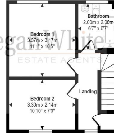
First Floor Approx 30 sq m / 321 sq ft