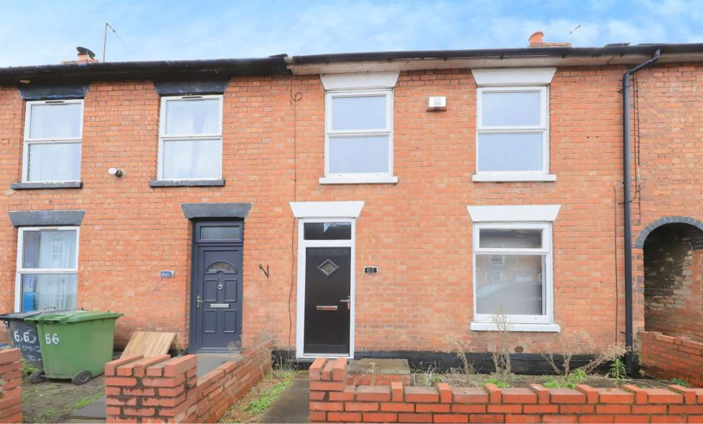
Wood Street, Kidderminster DY11 6UB