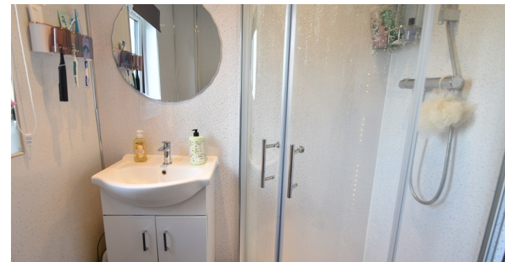
2 Bridgend Place