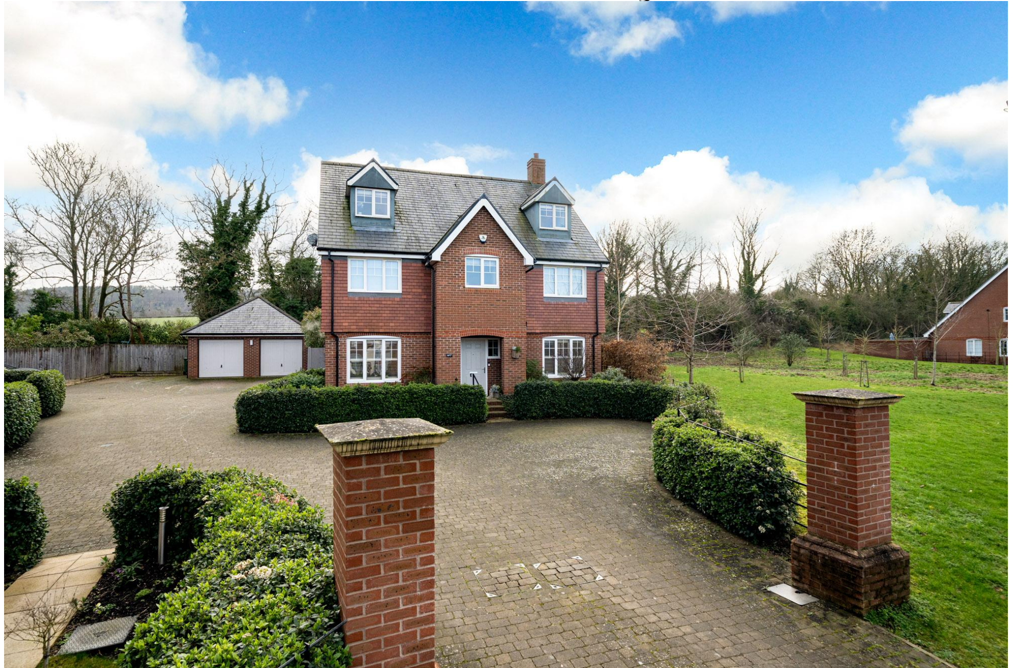
FLORA AVENUE, ASTON CLINTON, HP22 5FT