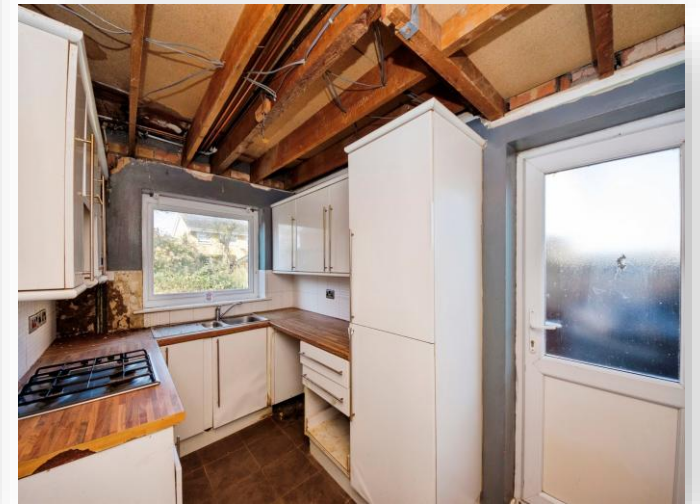
Millhouse Lane, Moreton, Wirral CH46 6HL