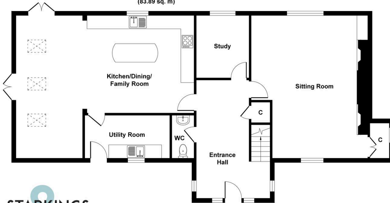
Ground Floor Approximate Floor Area 1215 sq. ft (112.87 sq. m)

Approx. Gross Internal Floor Area 2118 sq. ft / 196.76 sq. m