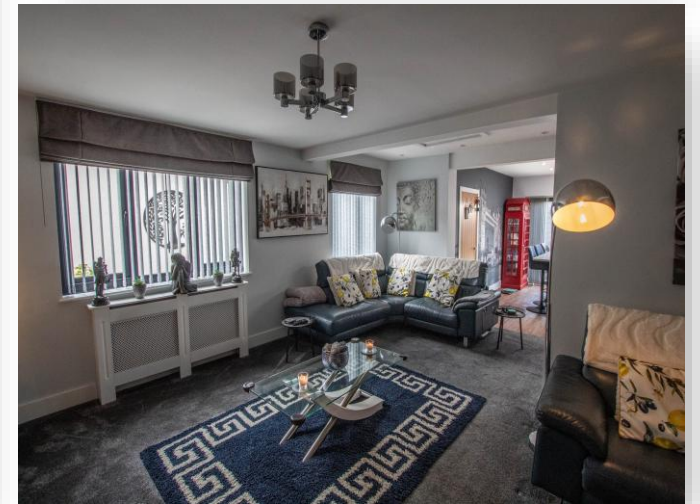
Ditton Walk, Cambridge, CB5 8QD