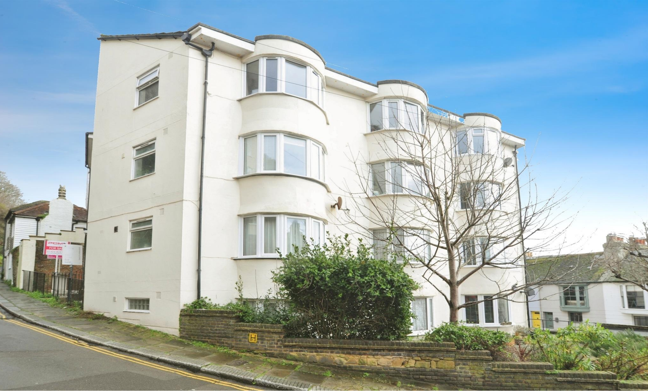
Unicorn House - Croft Road, Hastings TN34 3HE