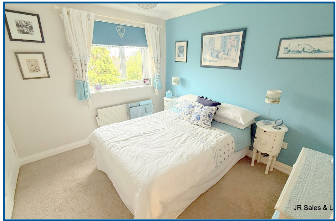
JR Sales & L