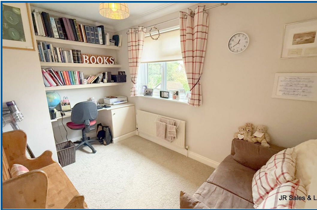
JR Sales & L