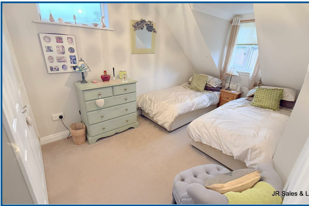
JR Sales & L