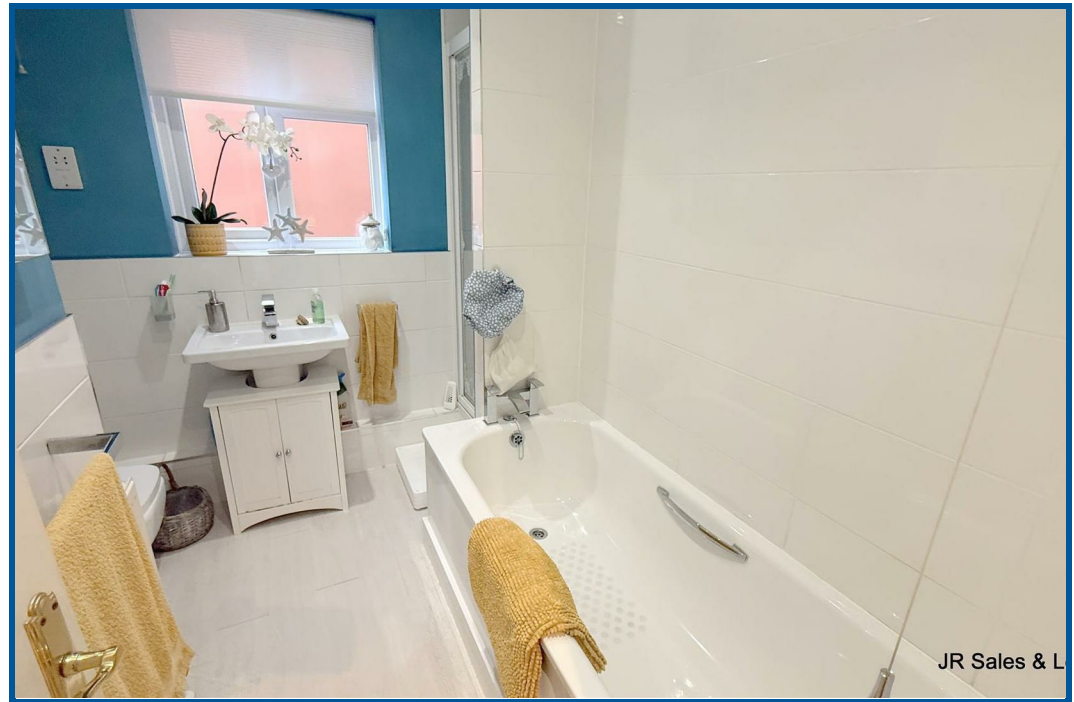
JR Sales & L