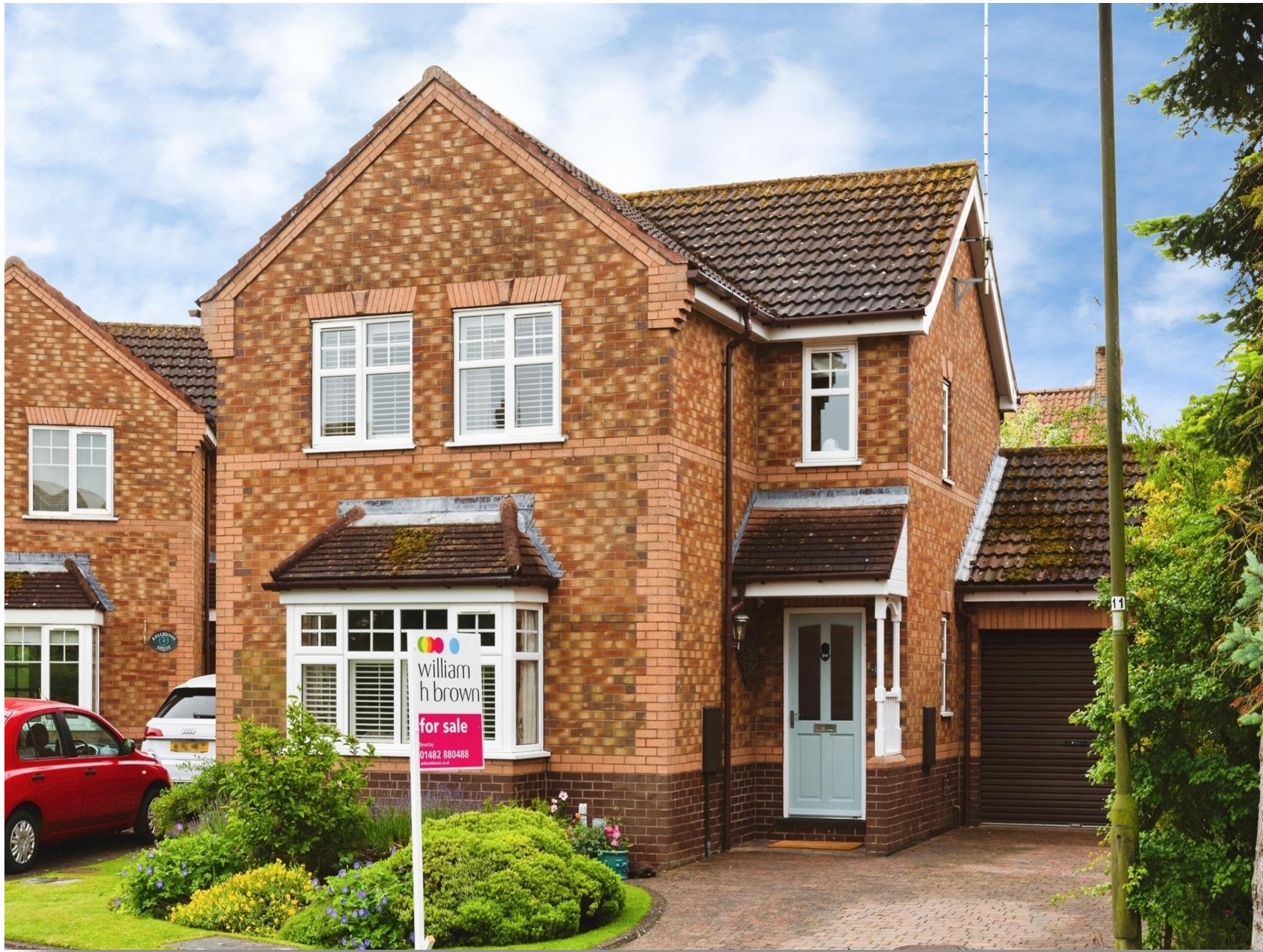
The Poplars, Leconfield, Beverley, HU17 7NB