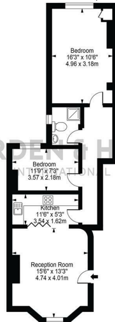
Upper Ground Floor For Illustration Purposes Only - Not To Scale

Brookfield Road Approx. Gross Internal Area 649 Sq Ft - 60.32 Sq M