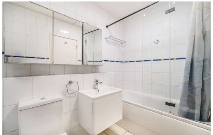
Kensington Gardens Square, W2