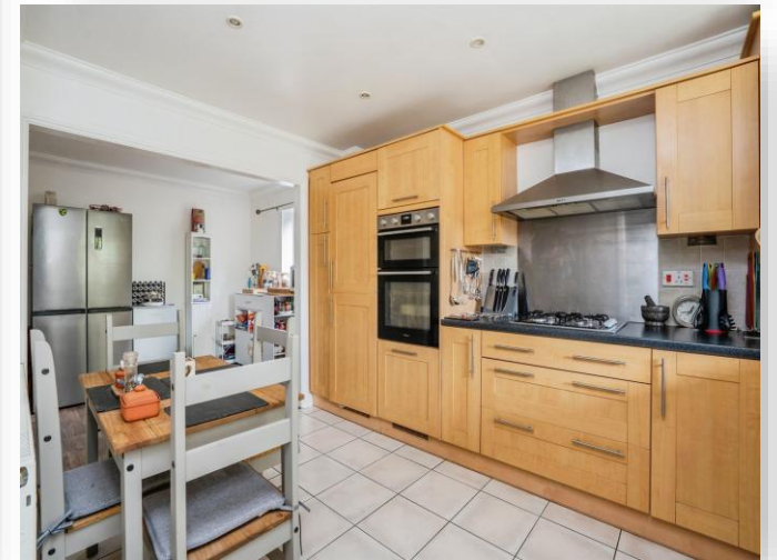
Hamilton Close, Waterlooville PO8 9GZ