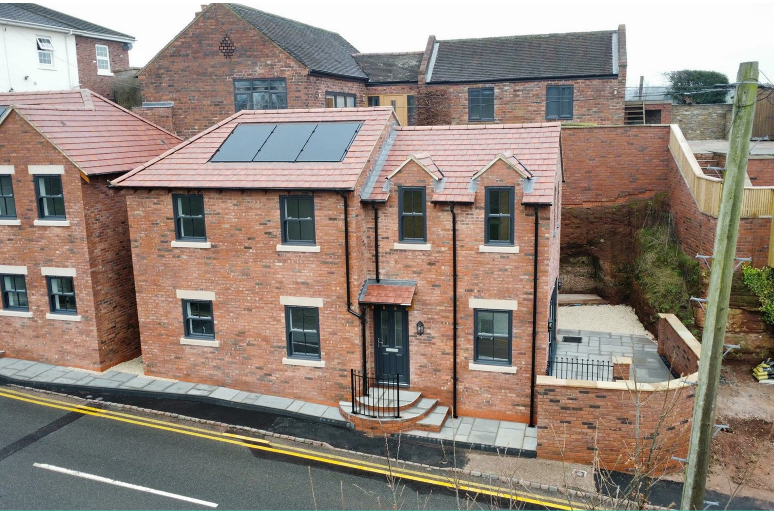
Tavern Cottage Caunsall Road, Cookley DY11 5YH