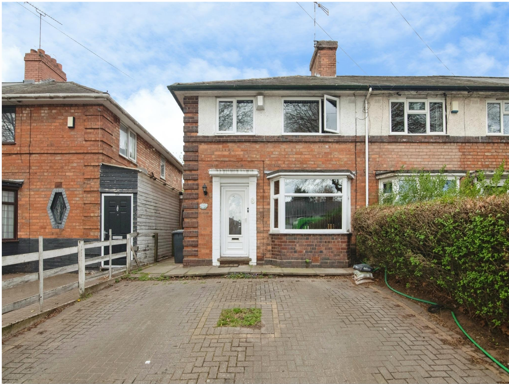
Warren Farm Road, BIRMINGHAM B44 0QA