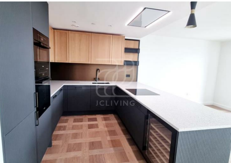
ML78 Apartment 1004, 2 Merino Gardens, London, E1W 2DR £1,846