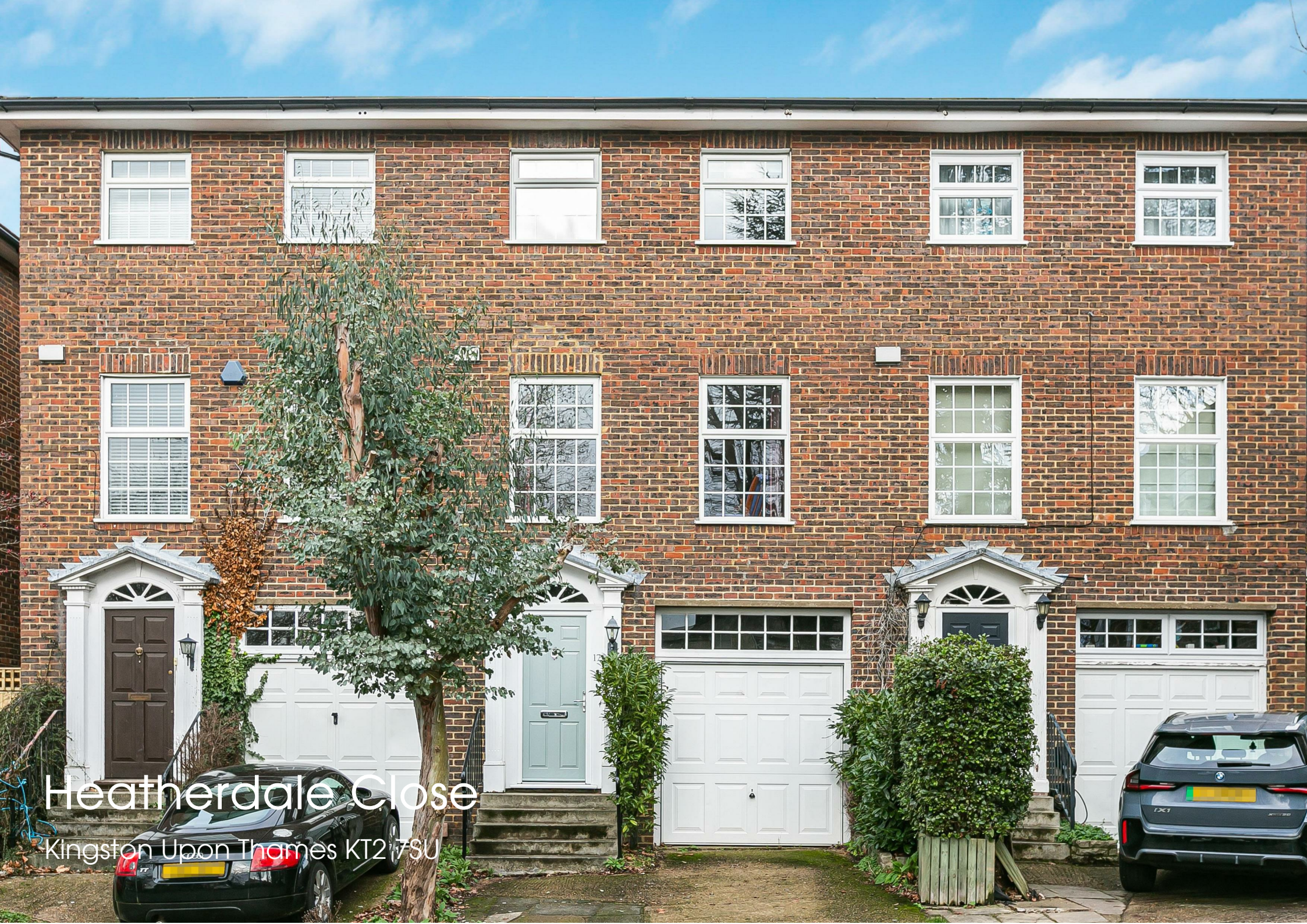
Heatherdale Close Kingston Upon Thames KT2 7SU