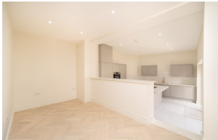
Geoffrey Road, SE4