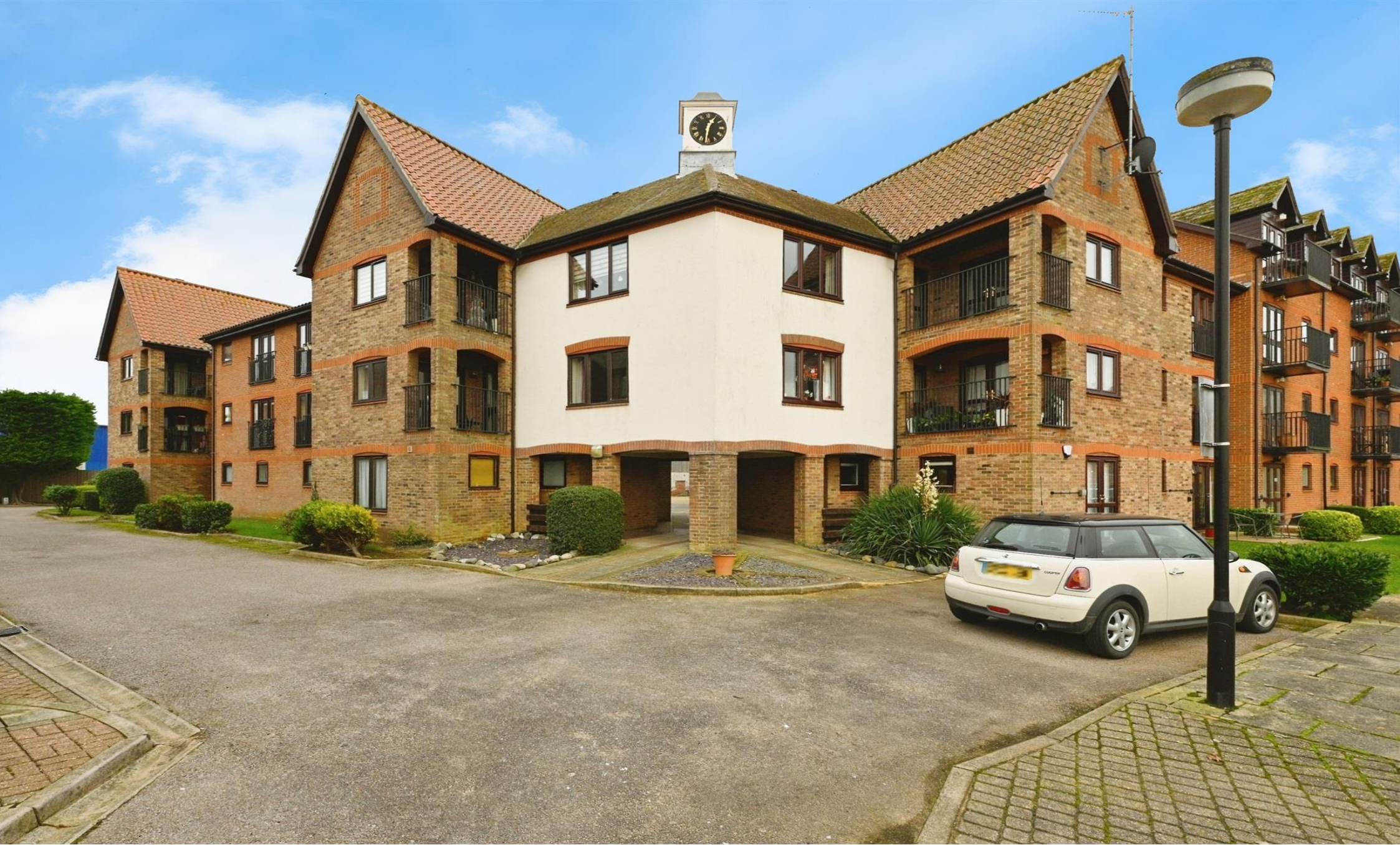
Trinity Quay, Page Stair Lane, KING'S LYNN, PE30 1NQ