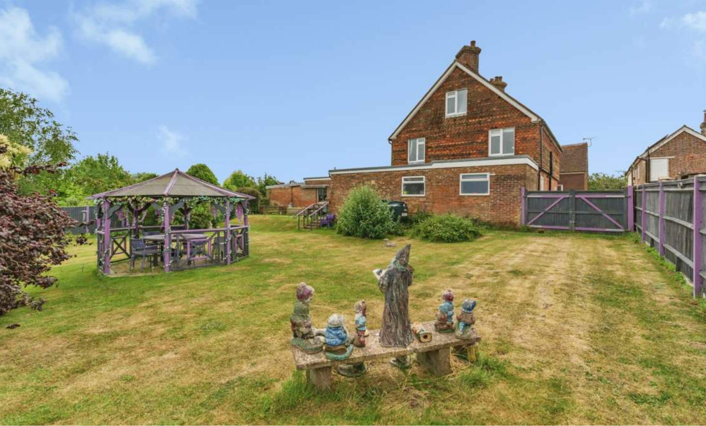
Inglenook Cottage, Windmill Hill, Hailsham BN27 4RT