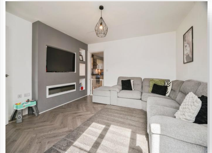
Pegasus Avenue, Stockton-On-Tees TS18 3QU