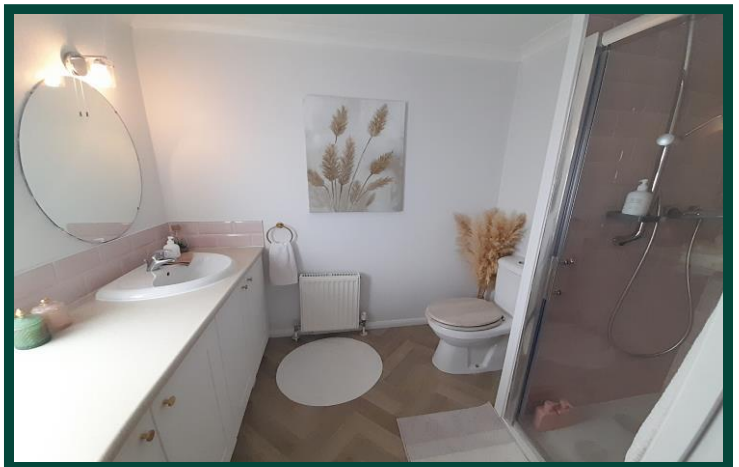
Principal En Suite