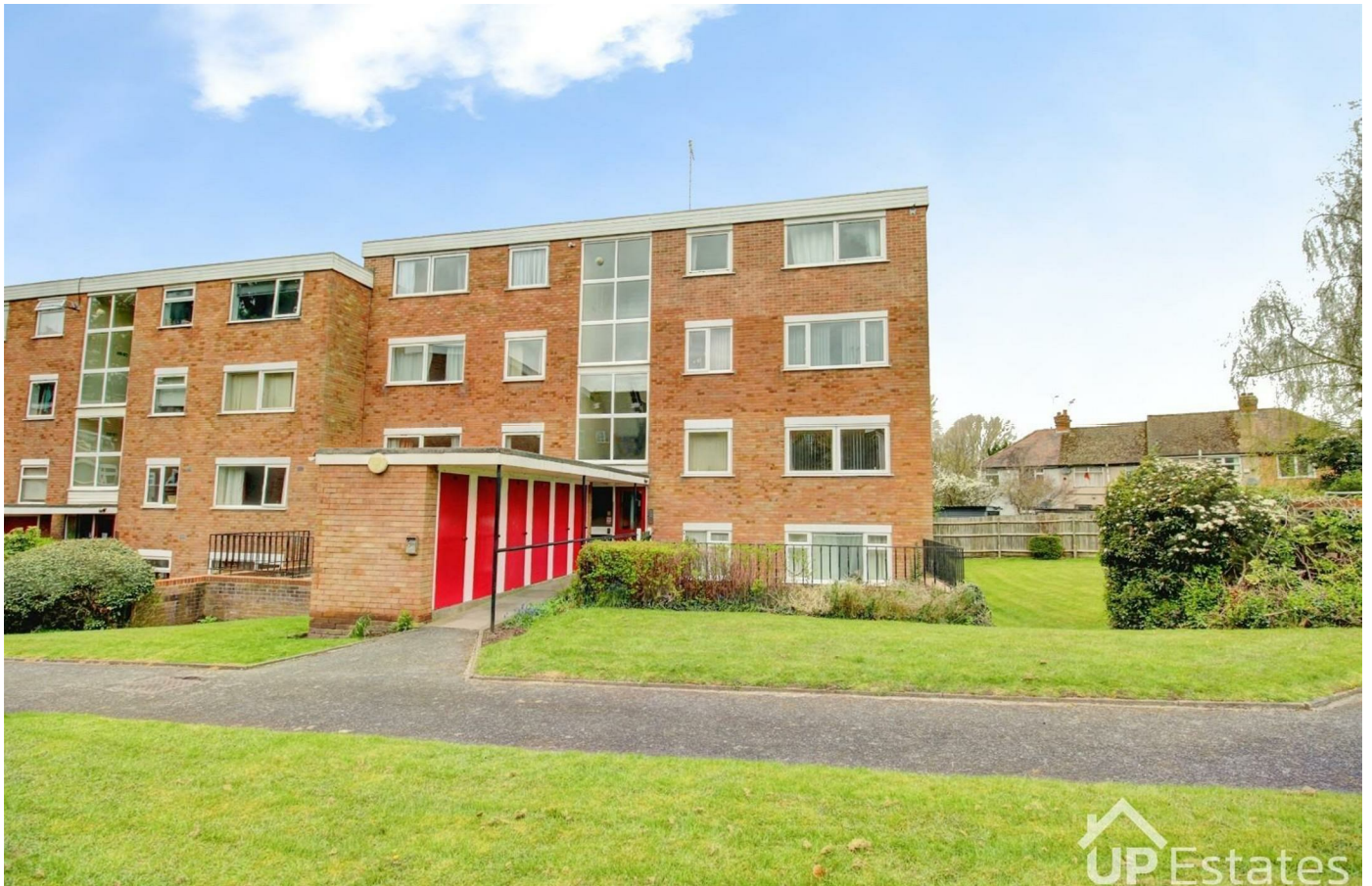
Bankside Close, Coventry