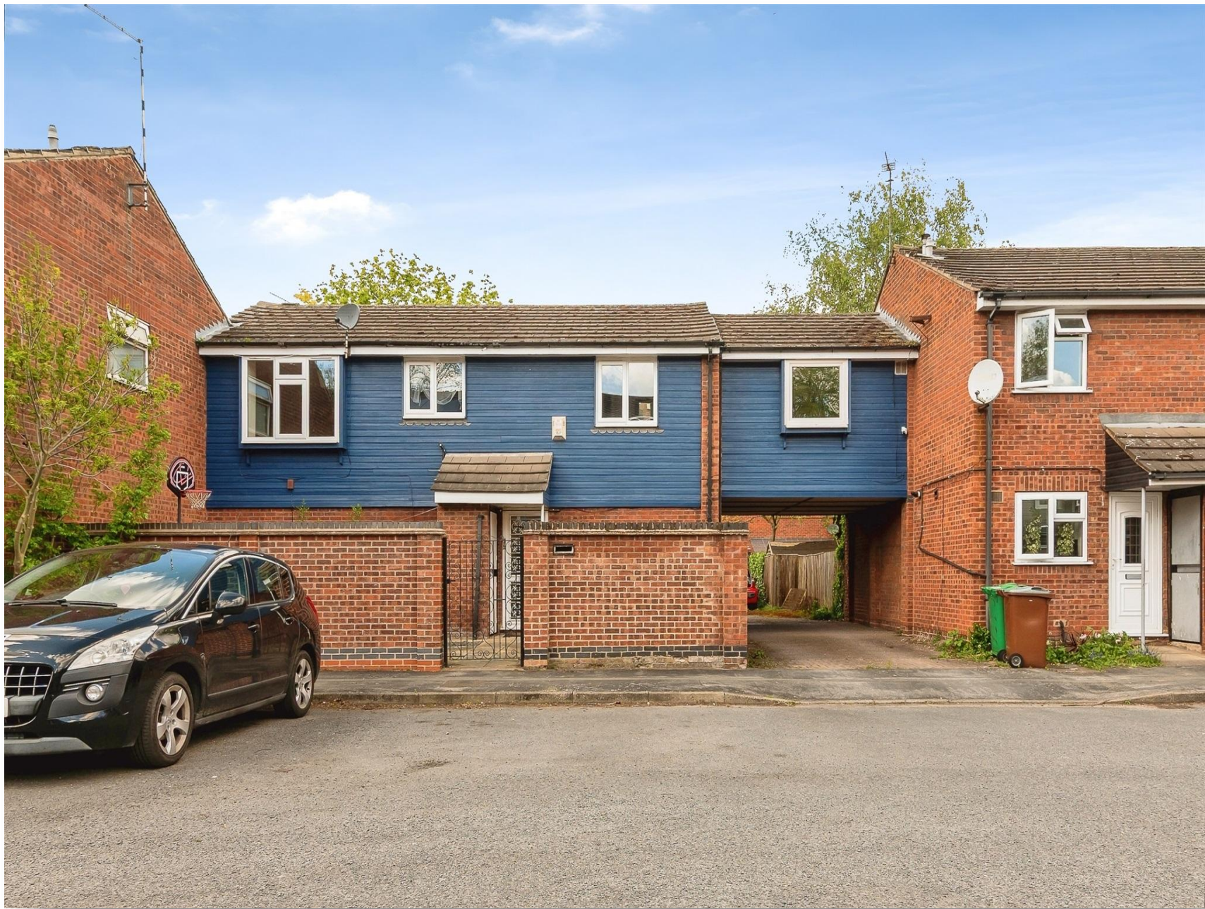
Ferngill Close, Nottingham NG2 1LB