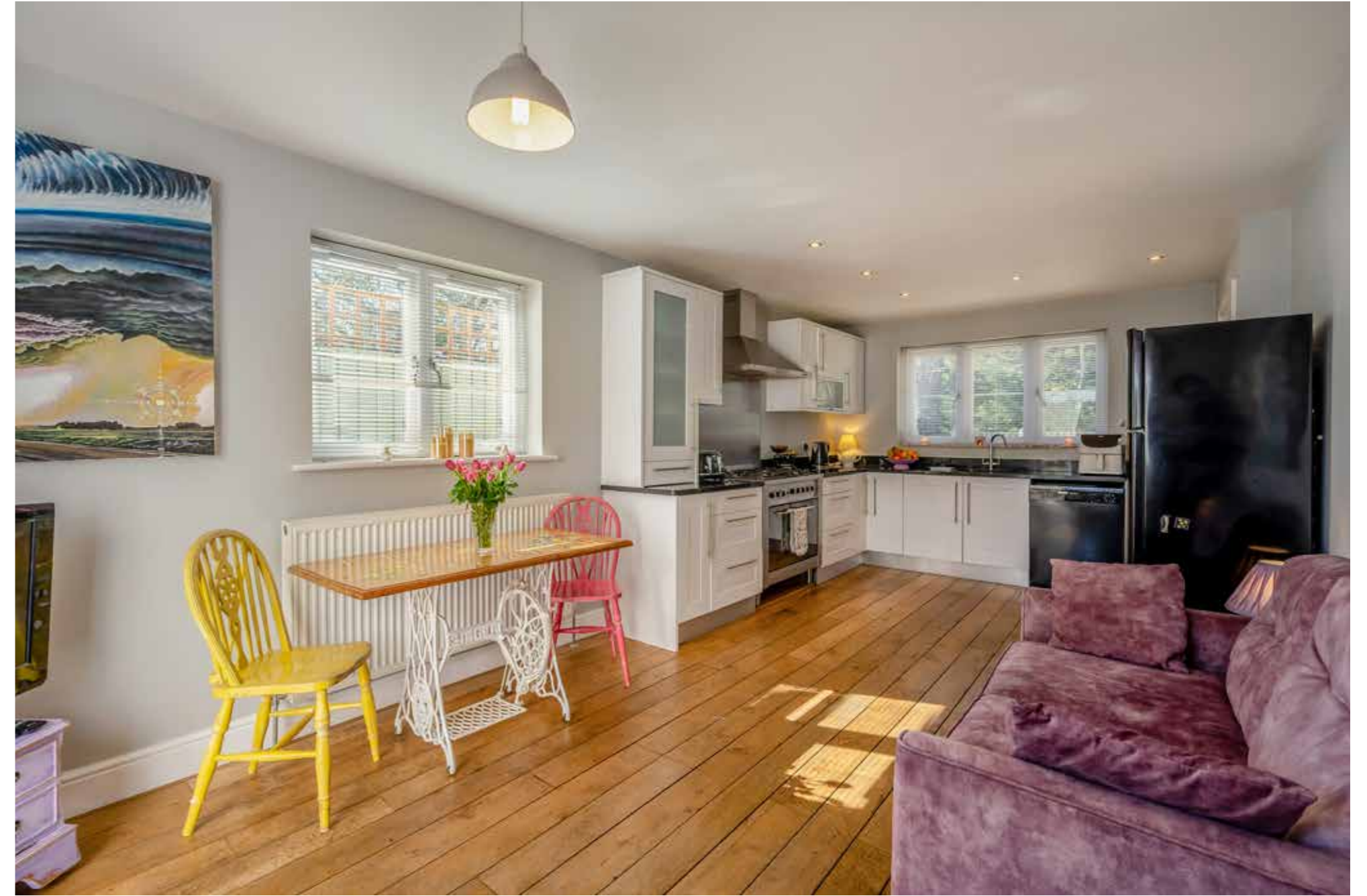
"With double doors opening directly onto the sunny patio, blending indoor and outdoor living beautifully..."