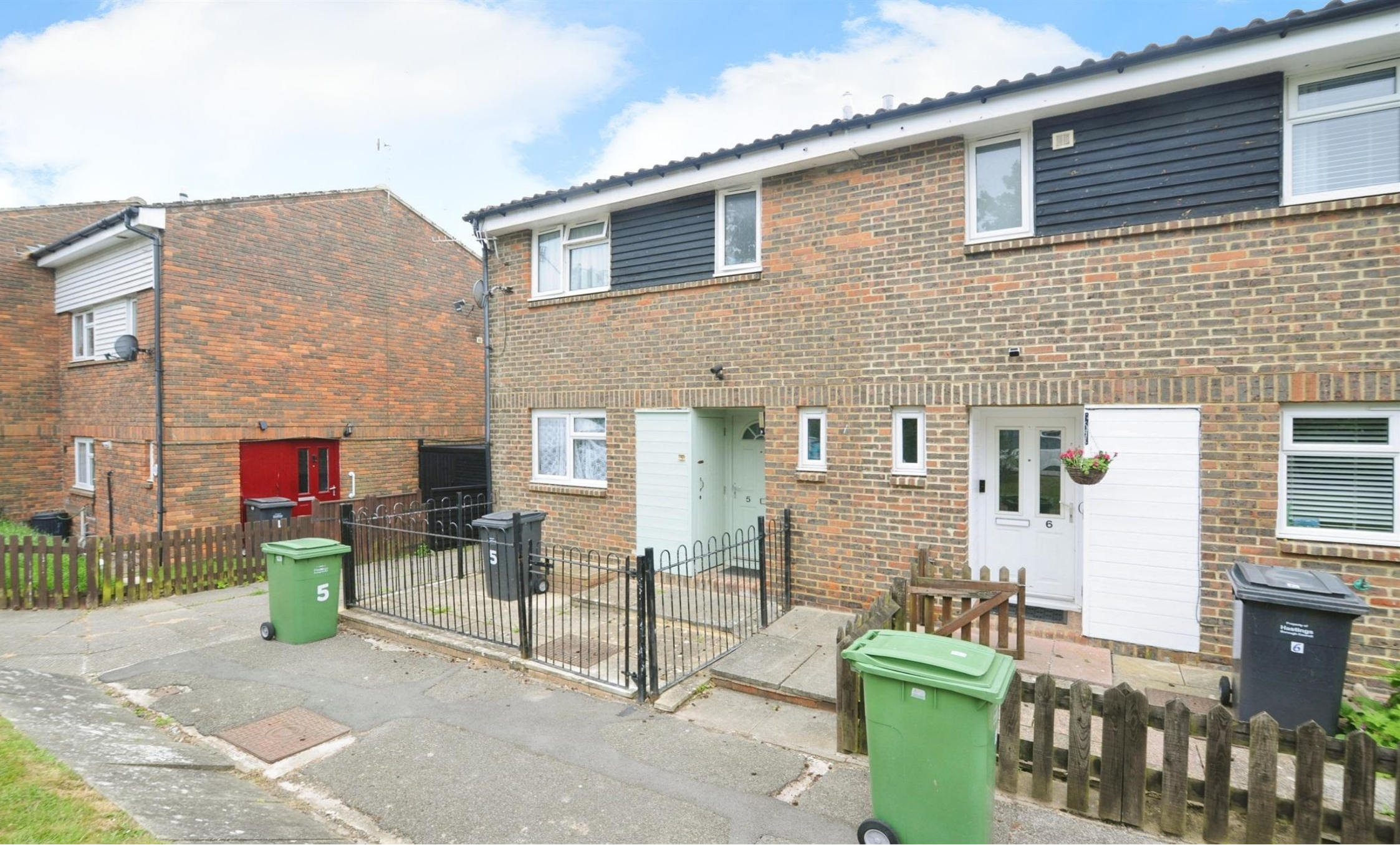
Meadow Close, St. Leonards-On-Sea TN38 9QD