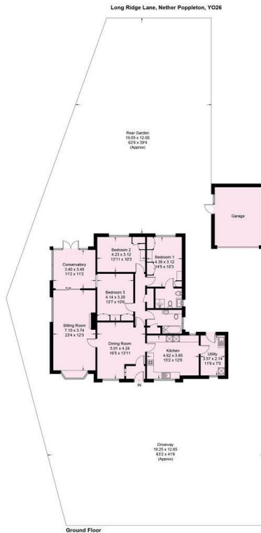
Illustration for identification purposes only. Measurements are approximate, not to scale. Pursuant to RICS Property Measurement 2nd Edition © Intelligent Property Marketing 2026