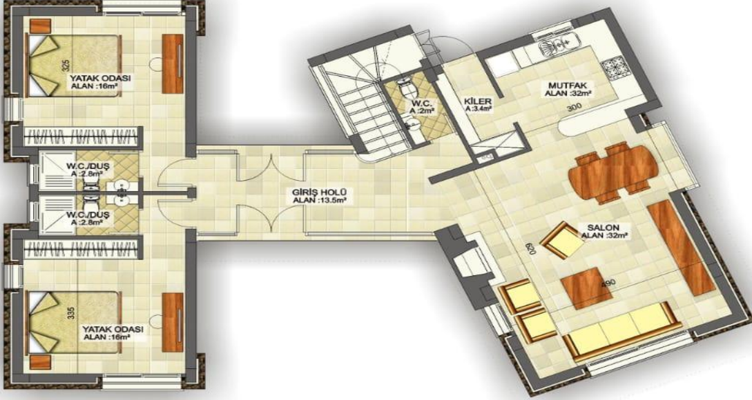
ZEMİN KAT PLANI ALAN : 133.5m 2