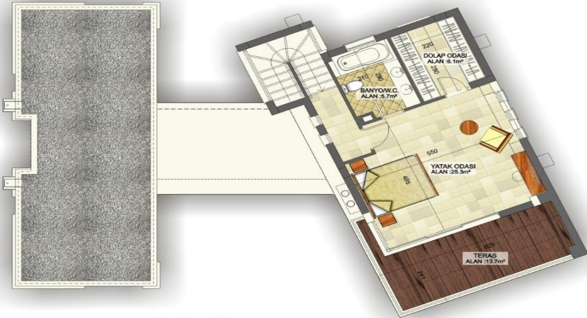
BİRİNCİ KAT PLANI ALAN : 49.5m 2