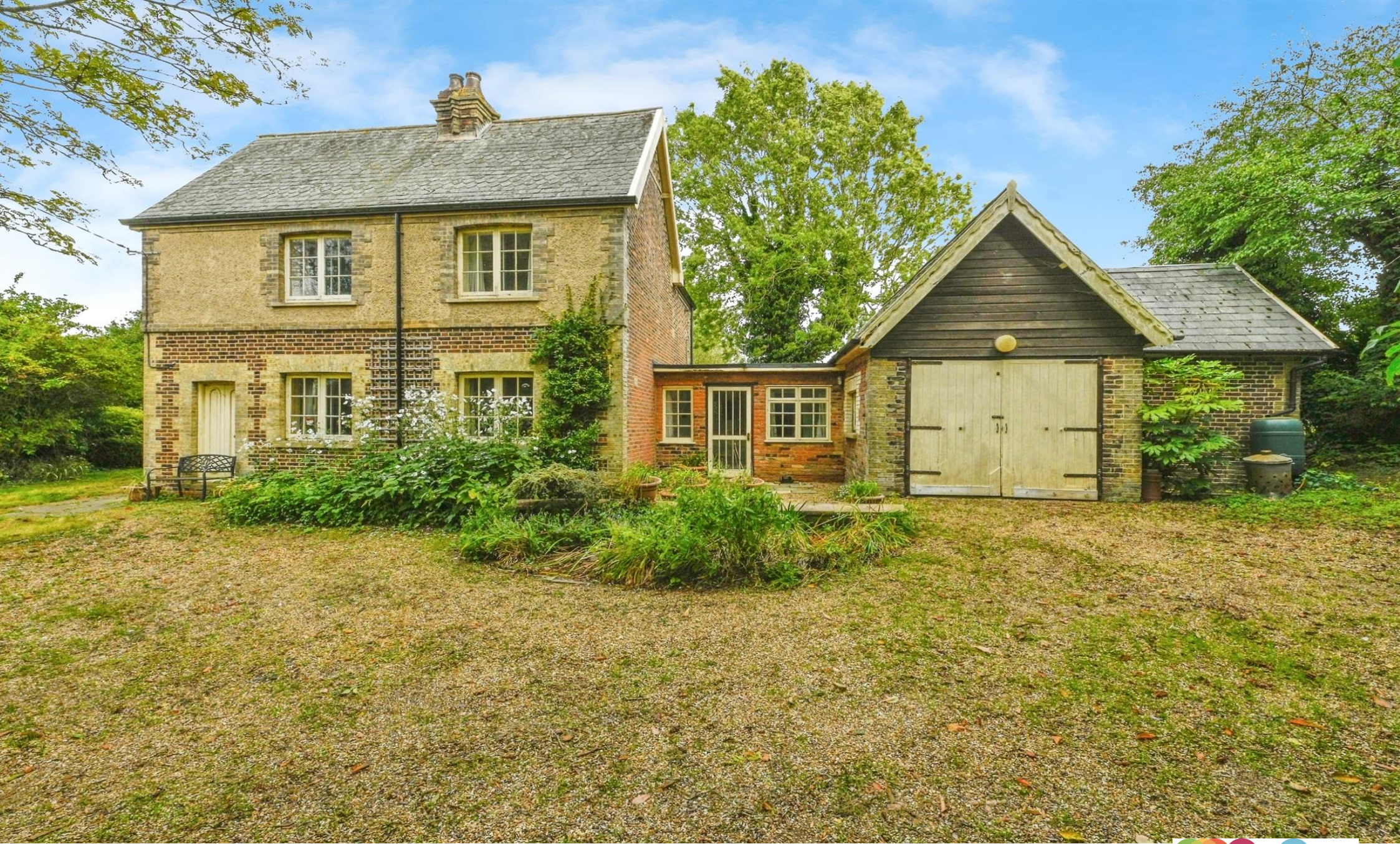
Islington Lodge Cottage, Pullover Road, Tilney All Saints, King's Lynn, PE34 4SF