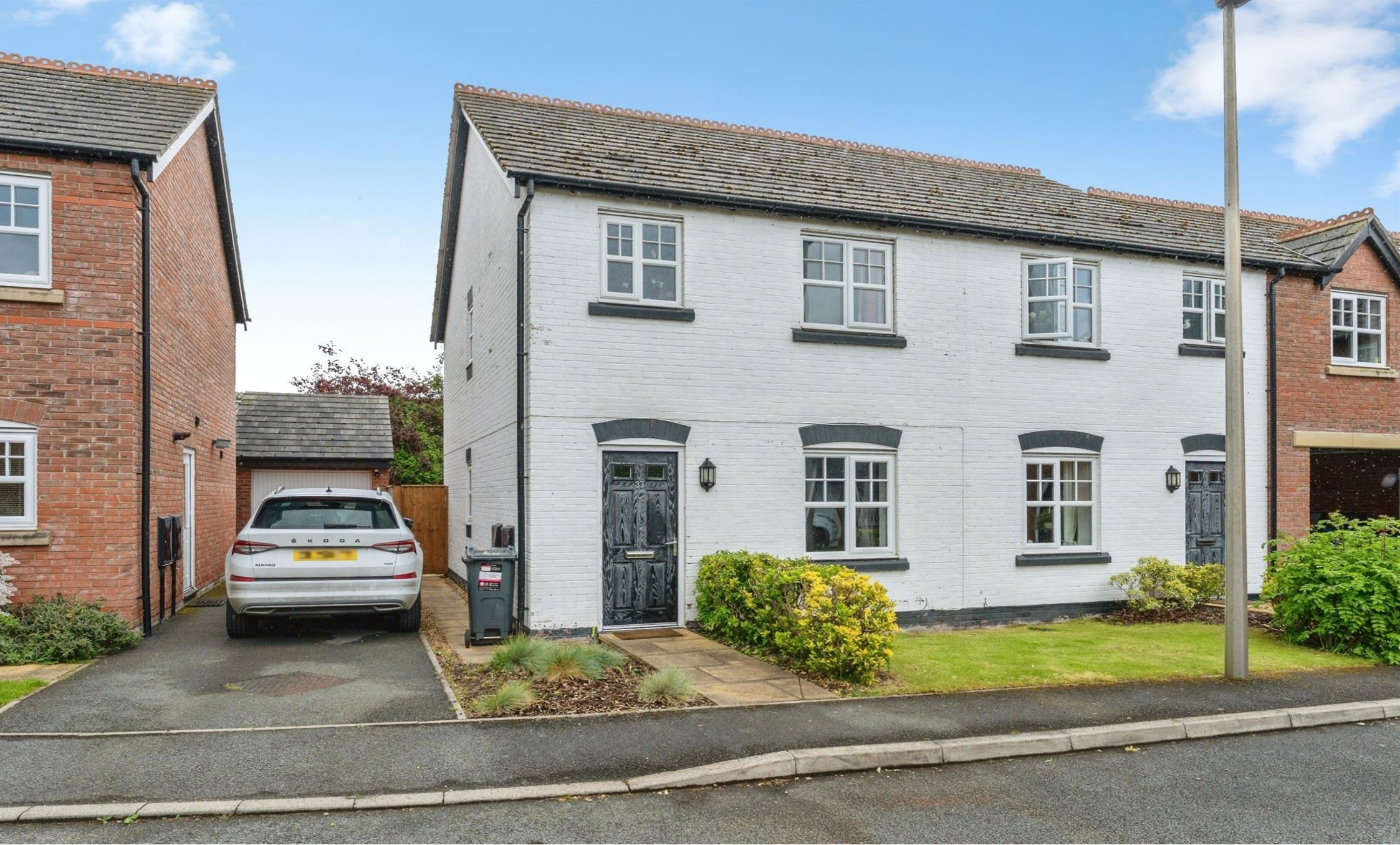
Granary Close, Milton Green Chester CH3 9DE