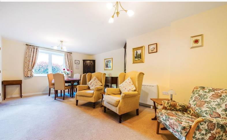
Living/ Dining Room