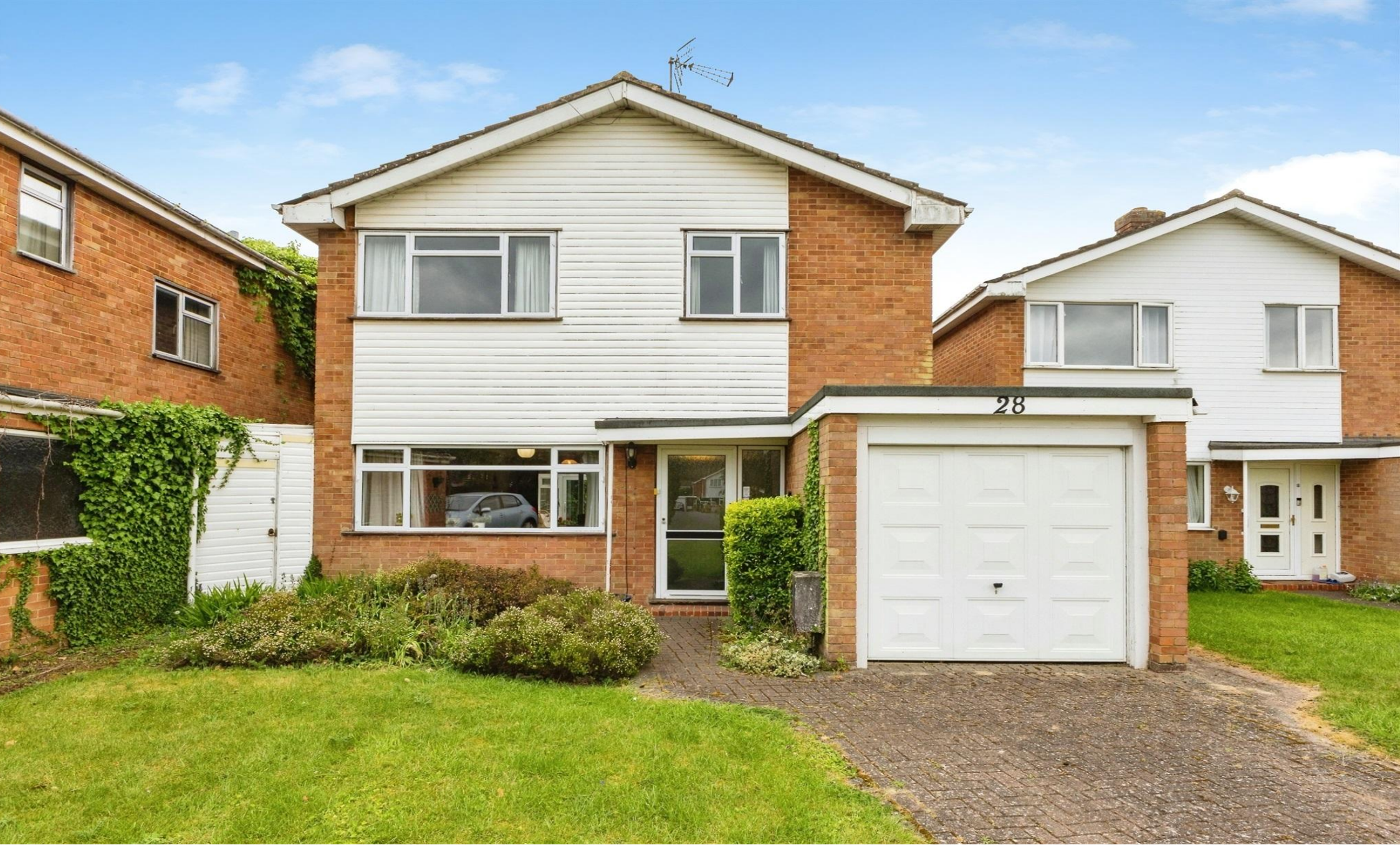
Nash Close, Earley Reading RG6 5SL