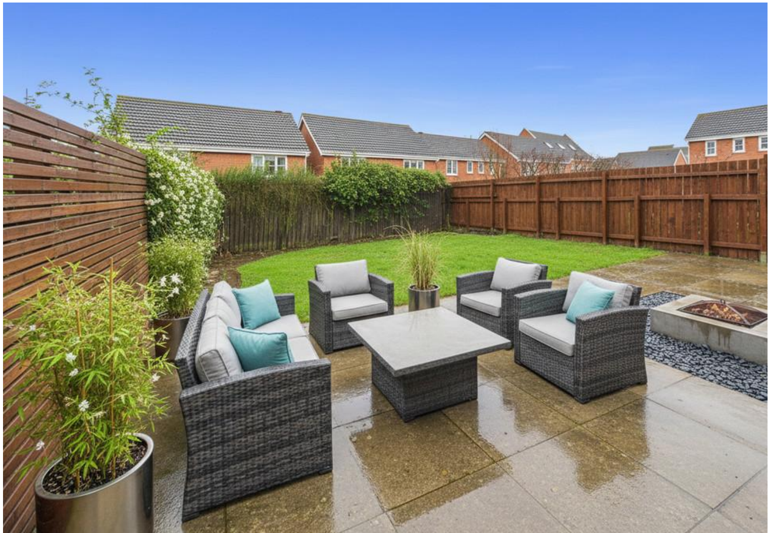
Virtually Staged Garden