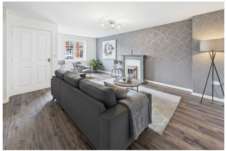
Virtually Staged Lounge