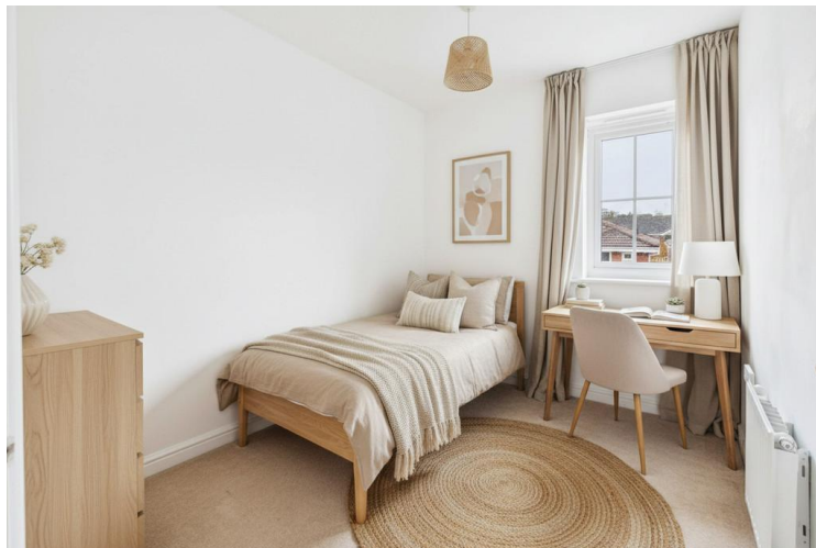
Virtually Staged Bedroom 3