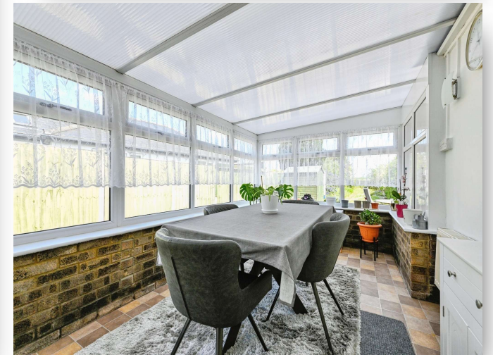
Lynn Road, Southery, Downham Market, PE38 0HT