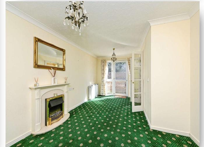
Wade Wright Court, Priory Road, Downham Market, PE38 9HY