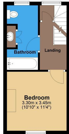
First Floor Approx. 23.7 sq. metres (254.8 sq. feet)