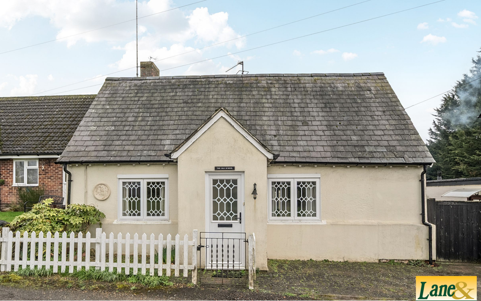
The Old School, 1 Church Green, Milton Ernest, Bedford, MK44 1RH