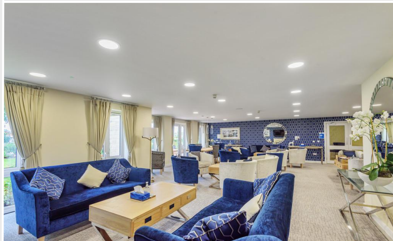
Communal Reception Room