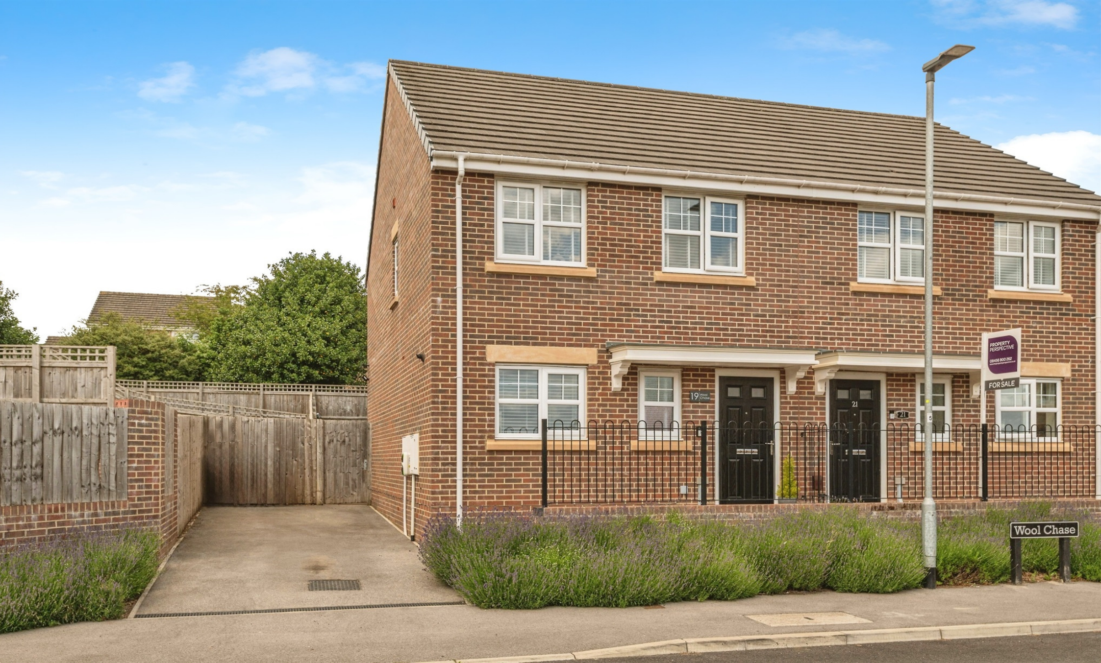
Wool Chase, Wakefield WF2 8FP