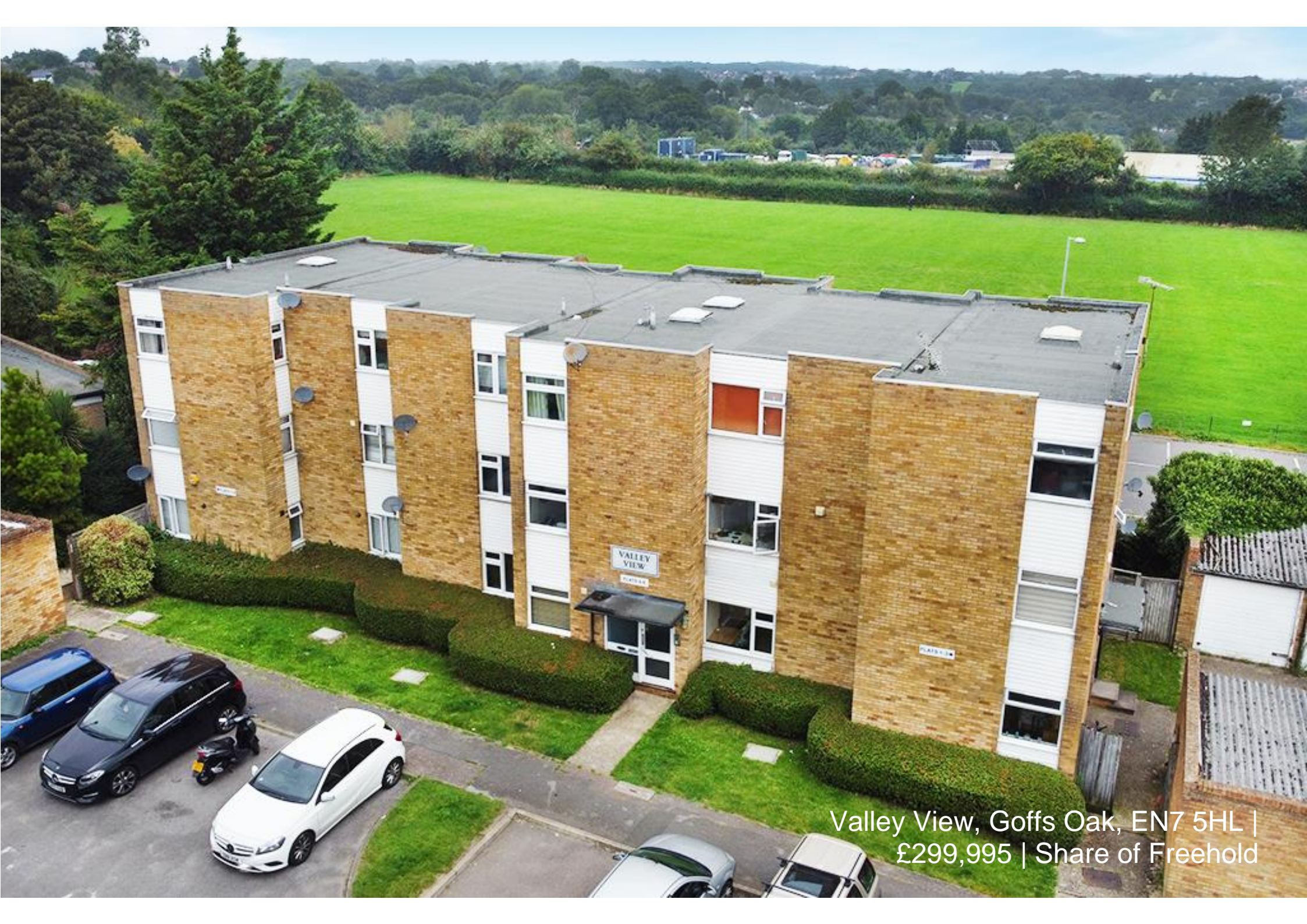
Valley View, Goffs Oak, EN7 5HL | £299,995 | Share of Freehold