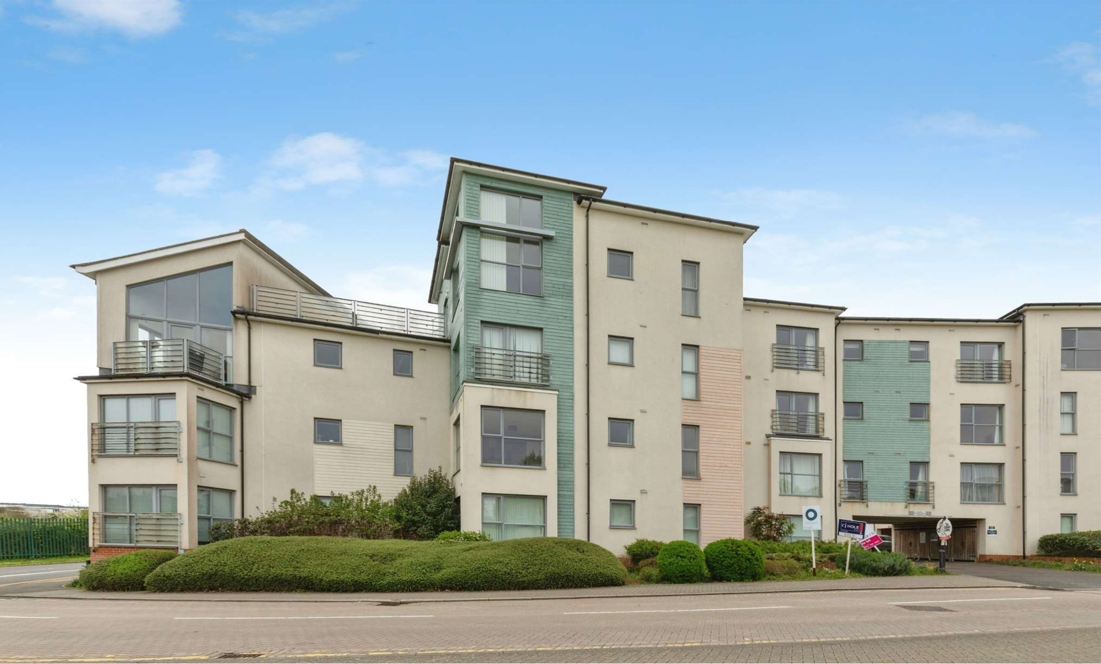
Long Down Avenue, Bristol BS16 1FT