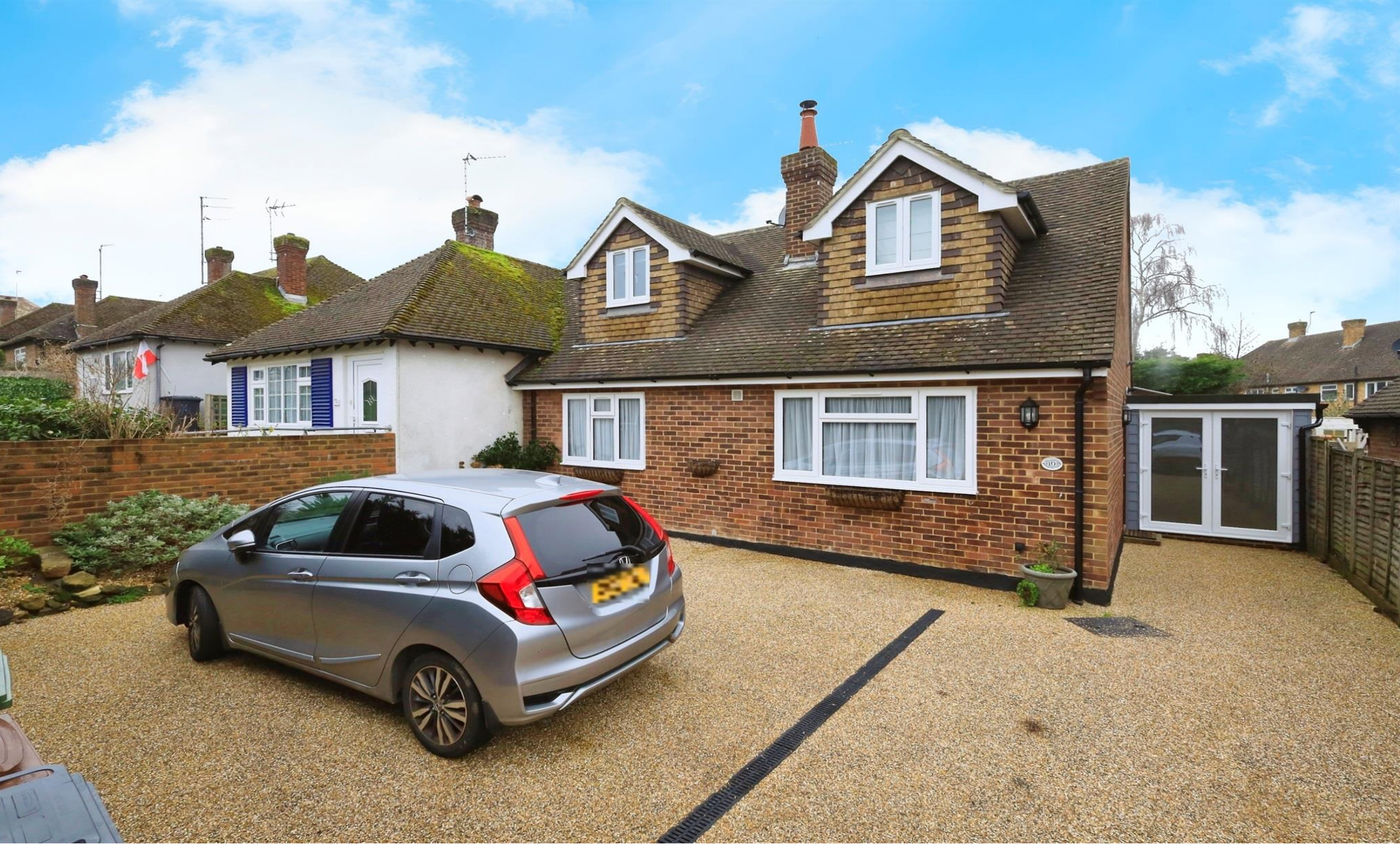
Amberstone View, Hailsham BN27 1JU