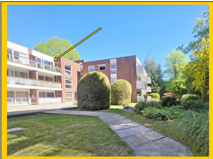
72 Square Metres / 775 Square Feet