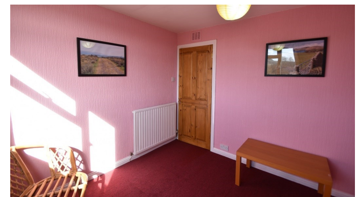
17 Stirling Road