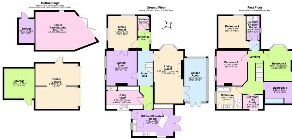
Total area: approx. 200.3 sq. metres (2156.0 sq. feet) Rose Bank, Canon Pyon, Hereford