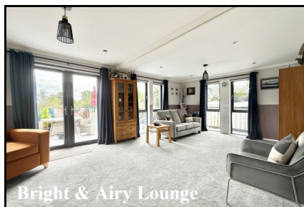
Bright & Airy Lounge