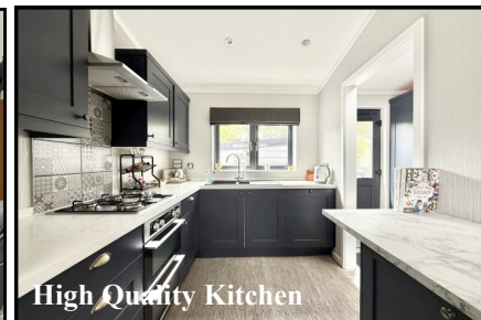
High Quality Kitchen