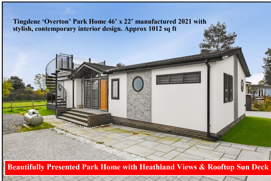
Tingdene 'Overton' Park Home 46' x 22' manufactured 2021 with stylish, contemporary interior design. Approx 1012 sq ft

1 Laurel Close, Lone Pine Park, Lone Pine Drive, Ferndown. BH22 8FS