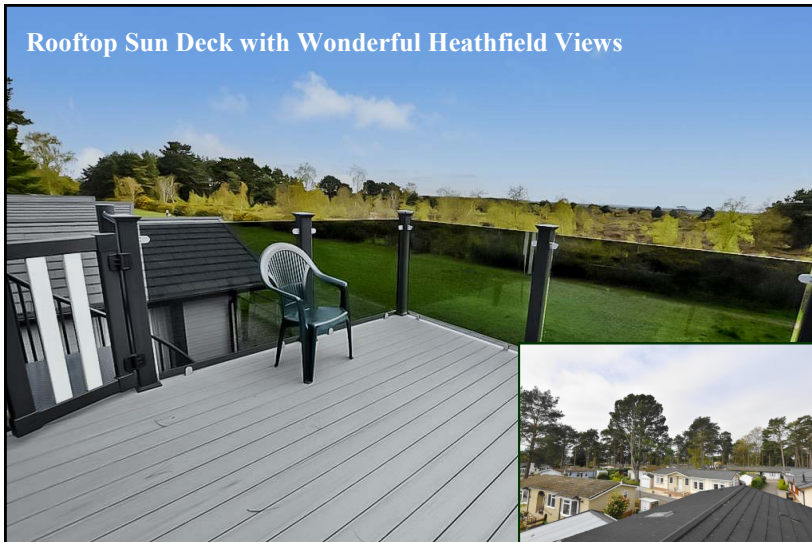
Rooftop Sun Deck with Wonderful Heathfield Views

Tingdene 'Overton' Park Home Approx 46' x 22' Manufactured 2021 High Quality Fixtures & Fittings throughout Vaulted Ceilings with LED lighting & Sky Lights window. Large Deck with lovely outlook Plus Rooftop Deck with Heathland Views Quality Residential Park with access to heathland walks & near to Ferndown Town Centre. Short drive from the seaside resorts of Bournemouth & Poole and the New Forest National Park