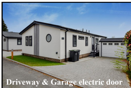
Driveway & Garage electric door