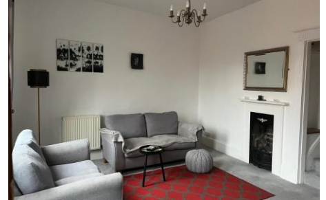
Imperial Chambers, 24 Widemarsh Street, , HR4 9EP