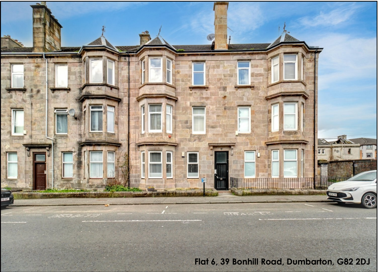
Flat 6, 39 Bonhill Road, Dumbarton, G82 2DJ

An attractive top-floor flat offering a versatile two-bedroom layout, set within a well-maintained traditional tenement in a highly convenient central location close to all amenities.