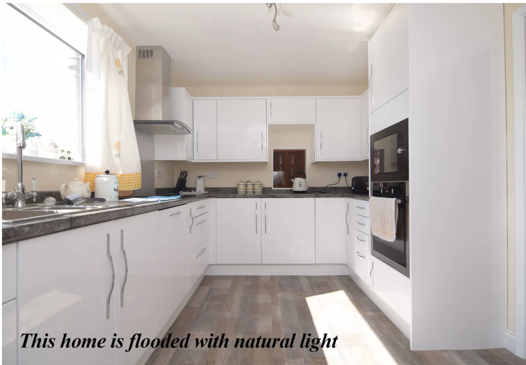
This home is flooded with natural light