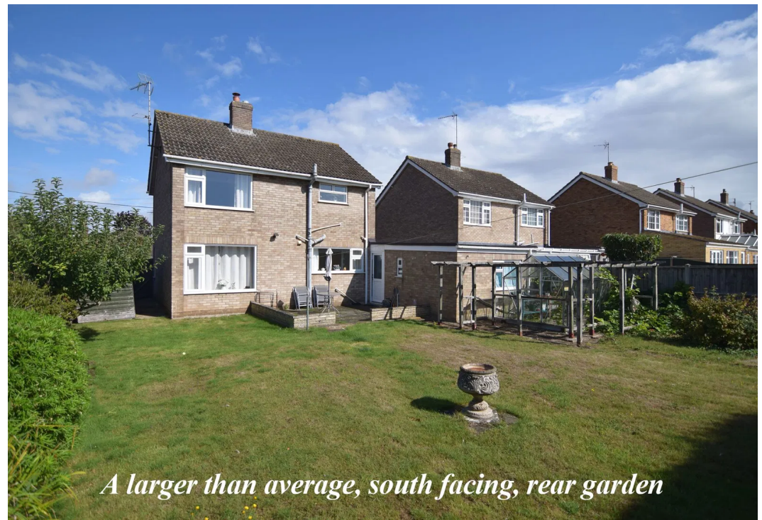
A larger than average, south facing, rear garden